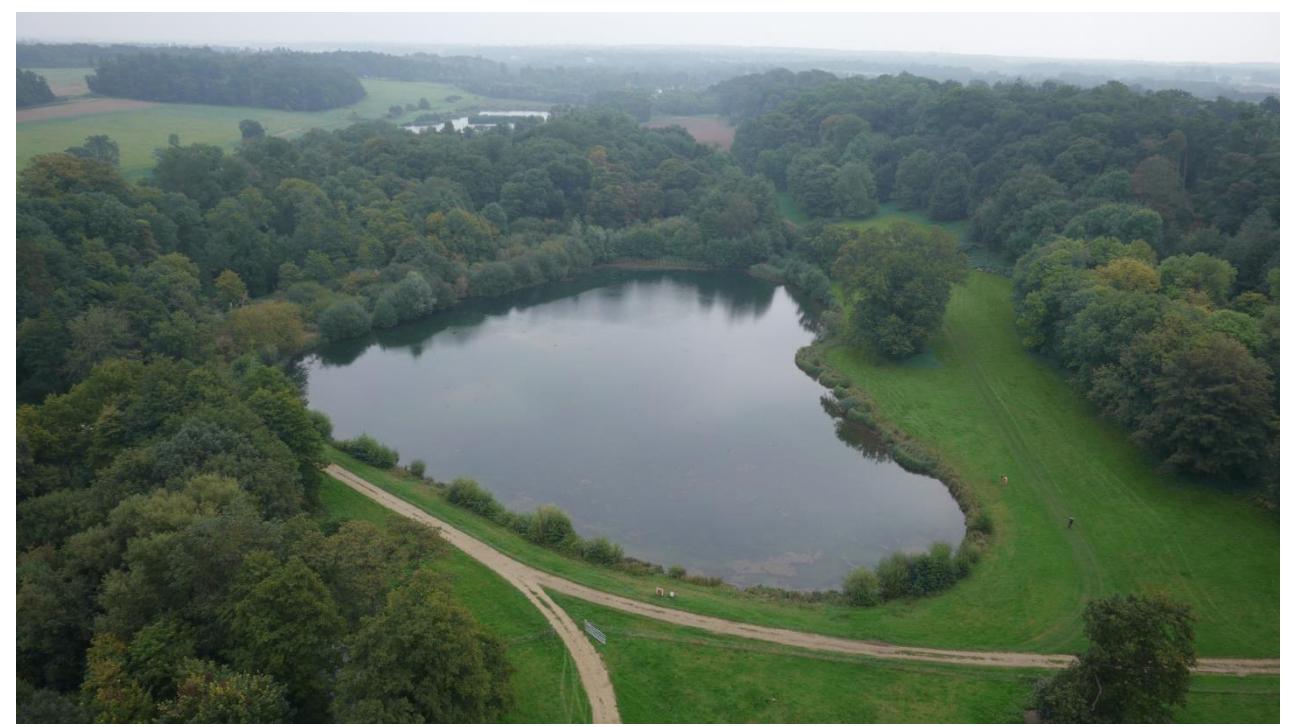
Scenic Panshanger park, site of this year's Welwyn 10K